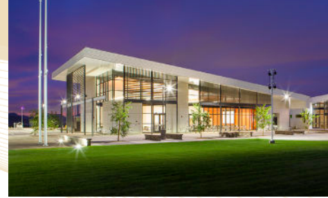
Central AZ College San Tan Campus

San Francisco Giants AT&T Park – San Francisco, CA Engineer/Contractor: SubAir Systems