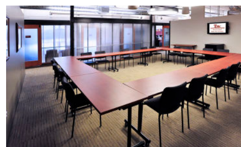
Truman Medical Center Behavioral Health