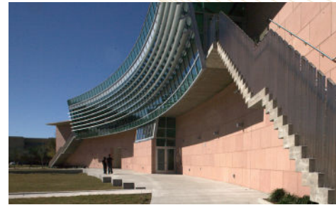
Del Mar College