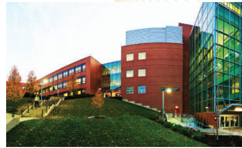
Cincinnati State Chemistry Lab