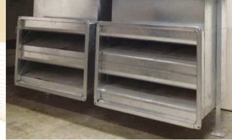
Broadcast Network Control Room

Tampa Bay Times Forum – Tampa Bay, FL Engineer: Smith Seckman Reid, Inc. Contractor: Tappouni Mechanical Services, Inc.