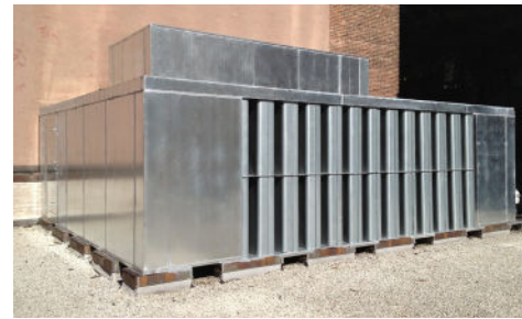
Mixed Use Luxury Building