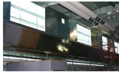
University of Minnesota - Biomedical Discovery District