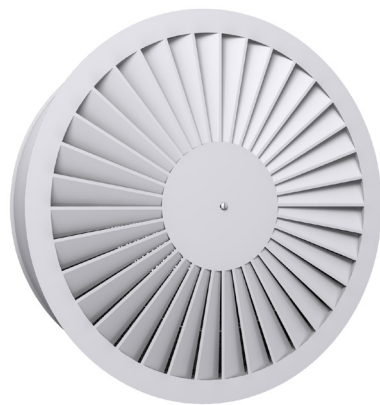
RVD round face