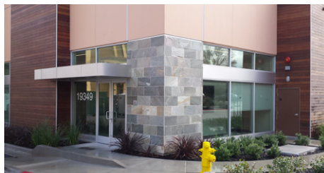
TD Ameritrade Cupertino